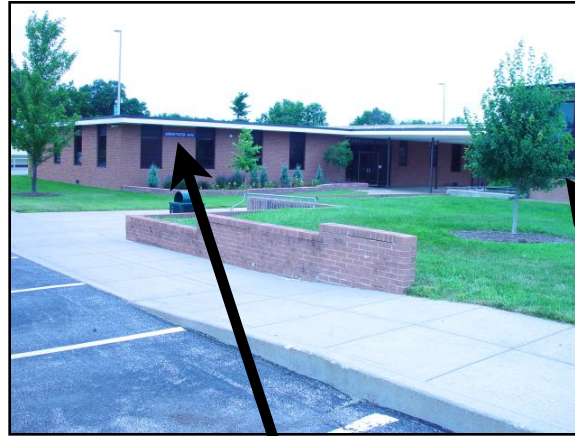
The Lindbergh Schools administrative offices.