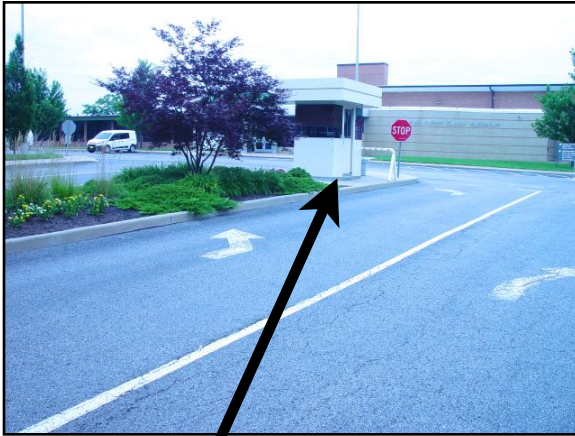
The guard box in the center of the divided drive at the main entrance to the high school from Lindbergh Blvd.