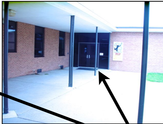
Enter through the double doors on the far side of the plaza. The rooms PD North and South will be on your right.