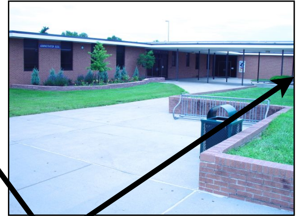
Classroom building number 300.