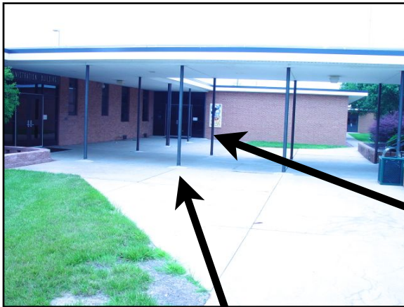
The plaza between the classroom building to the right and the administrative offices to the left.